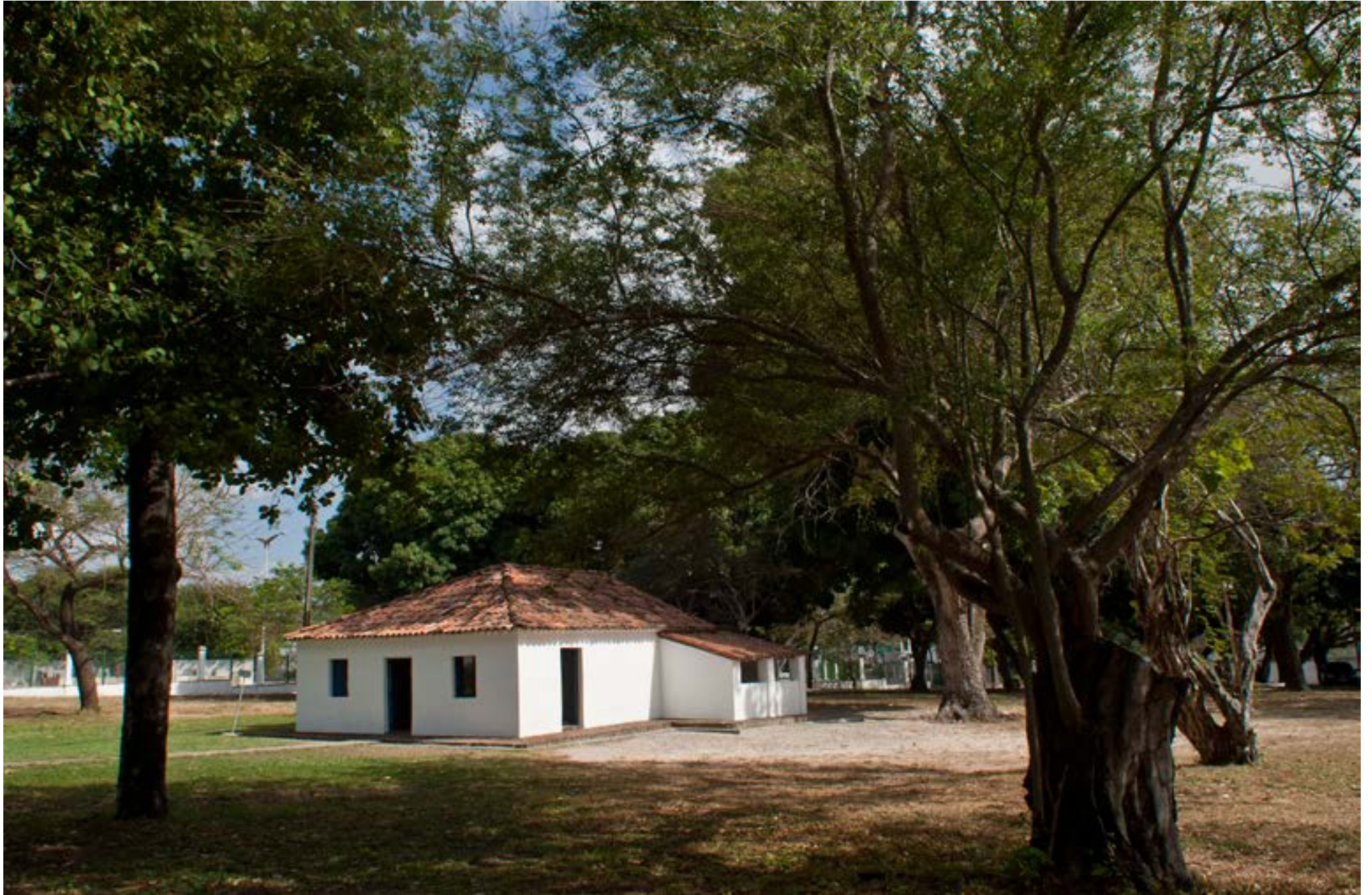
CASA JOSÉ DE ALENCAR (JOSÉ DE ALENCAR'S HOUSE)