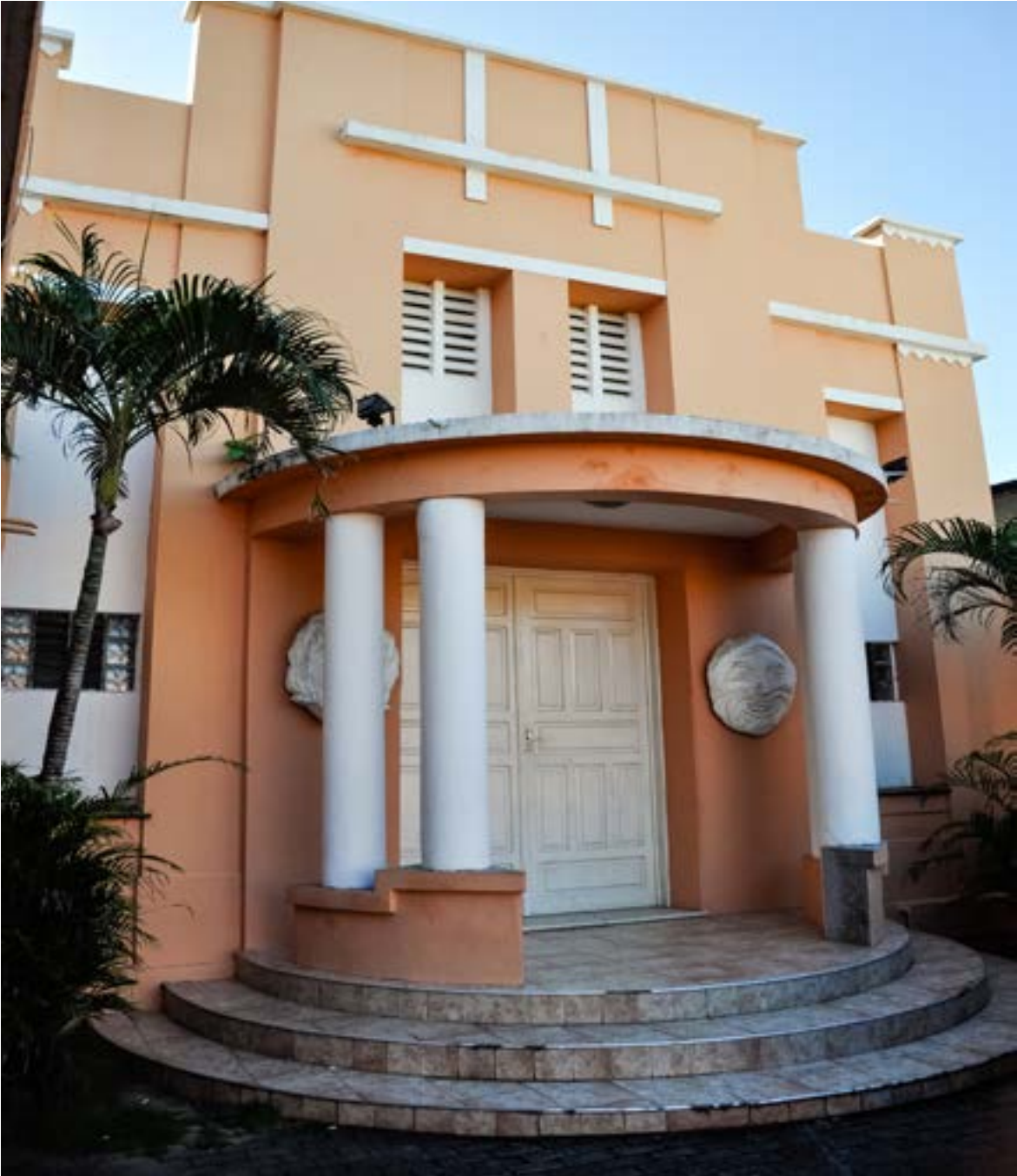
TEATRO PASCHOAL CARLOS MAGNO (PASCHOAL CARLOS MAGNO THEATER)